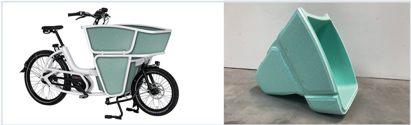
Fig. 4. Feasibility study for the Urban Arrow Shorty cargo bicycle: the transport container was made entirely from Arpro 35 Ocean particle foam