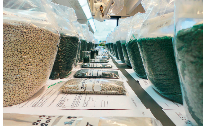
Fig. 3. Before delivery, the recyclates are analyzed and subjected to quality control

concern for either the manufacturers or the users of fishing gear. Plastix fishing gear recycling technology has been developed by combining tailor-made processing with adapted standard equipment to convert separated material into quality granulate for thermoplastic processing (Fig. 2).