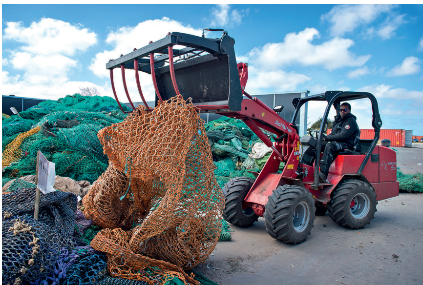
11% of the plastic waste in the sea comes from the maritime industry. For the recycling of old fishing nets and ropes, accurate sorting is very important

This is also relevant for companies from an economic perspective. Due to the increasing Extended Producer Responsibility (EPR), in which producers are financially responsible for the waste management and recycling of their end-of-life products, companies have to deal with this issue