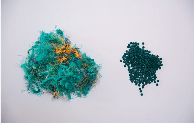
Fig. 2. Mechanical recycling turns the maritime waste back into high-quality plastic granulate